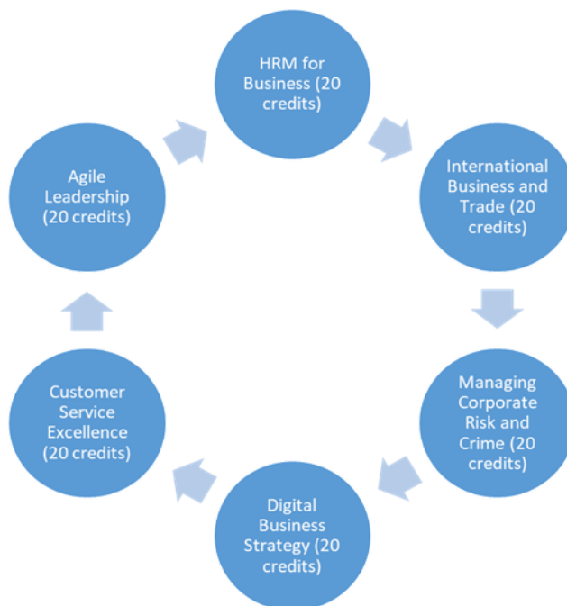
Fig 3: Illustration of the Carousel Model for Level 6 BA (Hons) Business Management